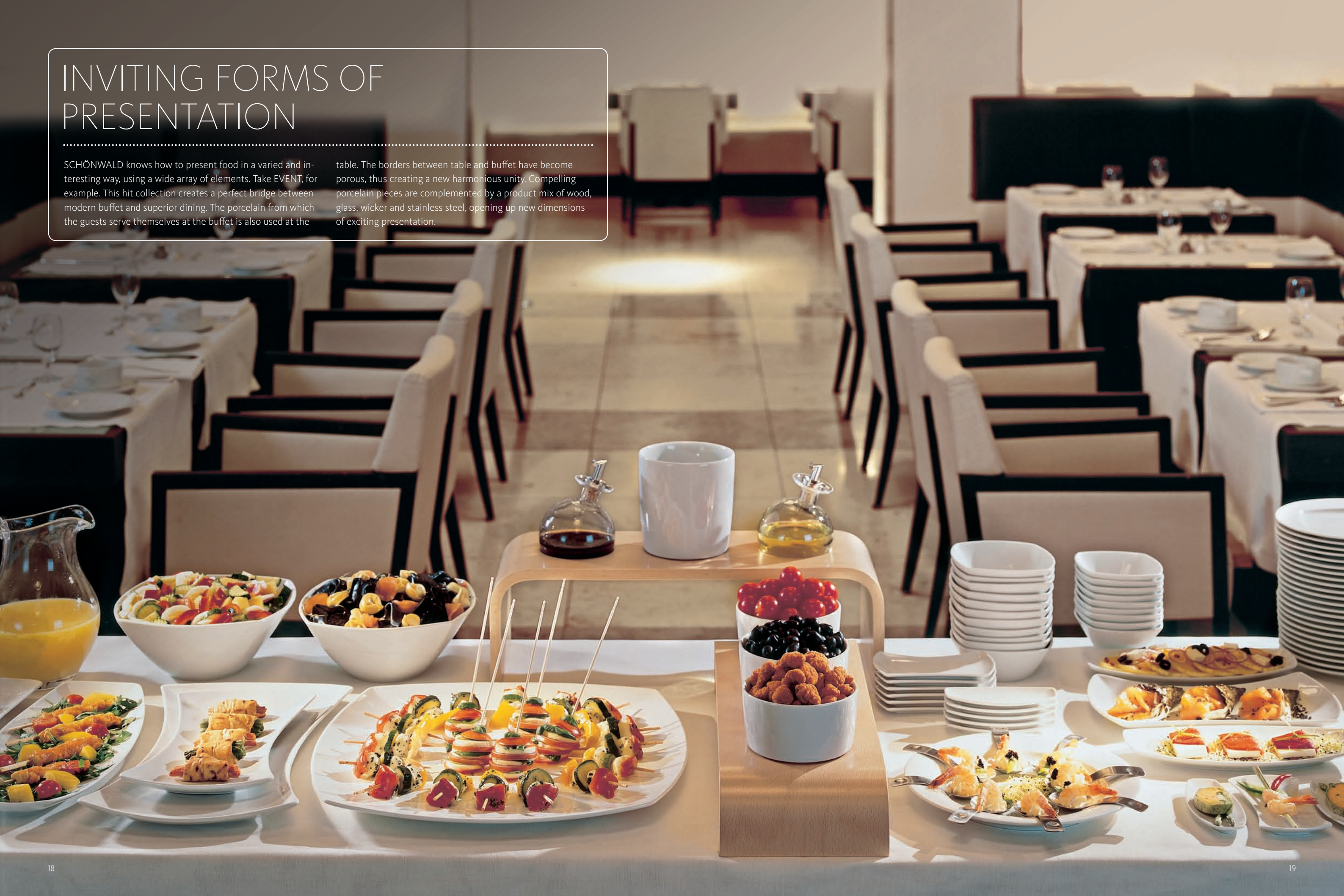
table. The borders between table and buffet have become porous, thus creating a new harmonious unity. Compelling porcelain pieces are complemented by a product mix of wood, glass, wicker and stainless steel, opening up new dimensions of exciting presentation.

SCHÖNWALD knows how to present food in a varied and interesting way, using a wide array of elements. Take EVENT, for example. This hit collection creates a perfect bridge between modern buffet and superior dining. The porcelain from which the guests serve themselves at the buffet is also used at the